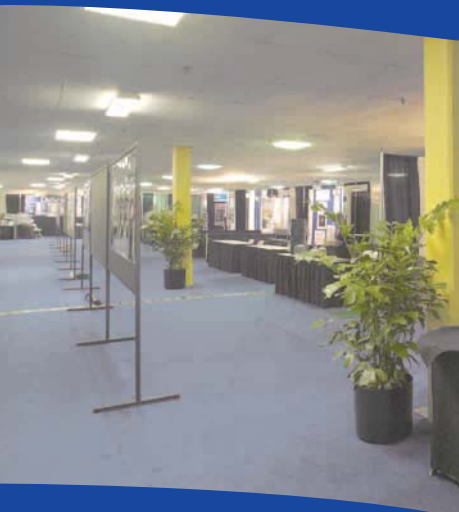
Lower Level Meeting Complex sq. ft. 20,000 (with exhibit capabilities of 125 8'x10" sections)